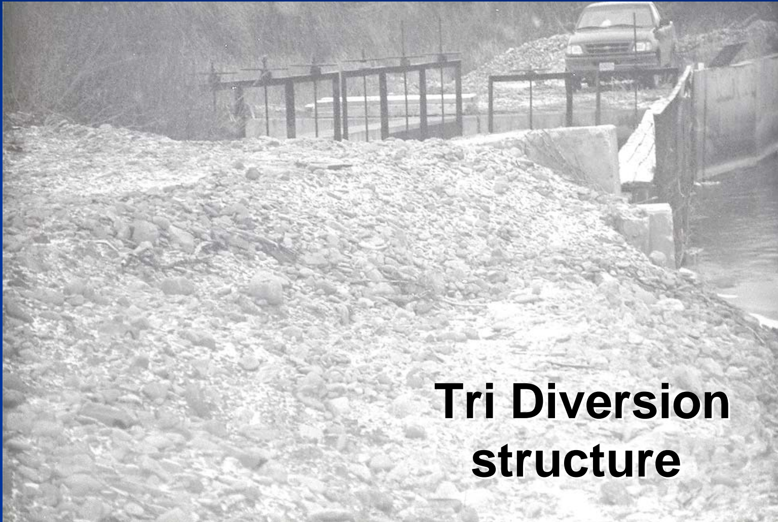
Tri Diversion structure