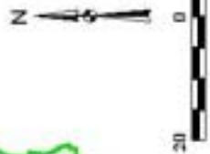
Figure 1 Water Conservation Studied Stream Gages