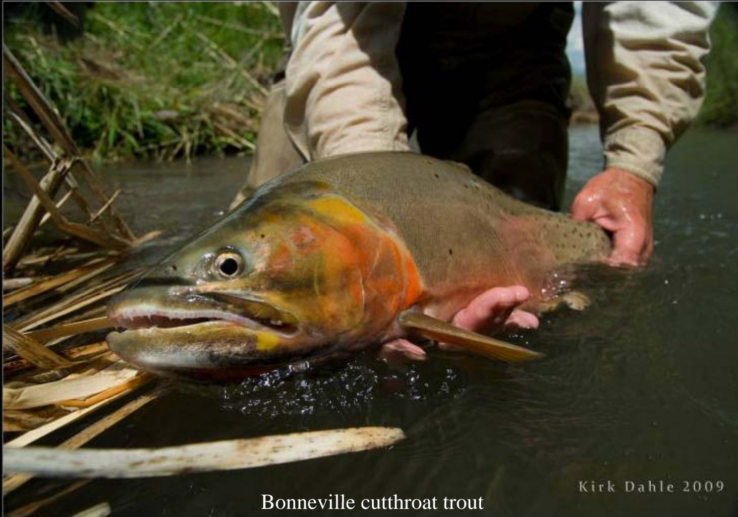
Bonneville cutthroat trout