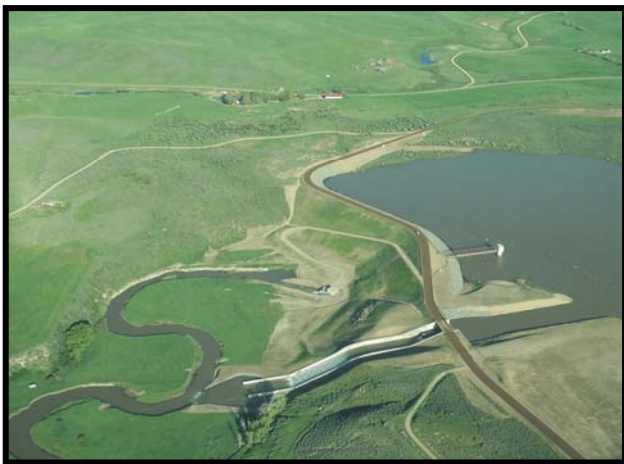
After Elkhead Reservoir filled in 2007, up to 5,000 acre-feet of permanent storage and 2,000 acre-feet of leased storage water is now available each year to augment Yampa River flows for the endangered fish.